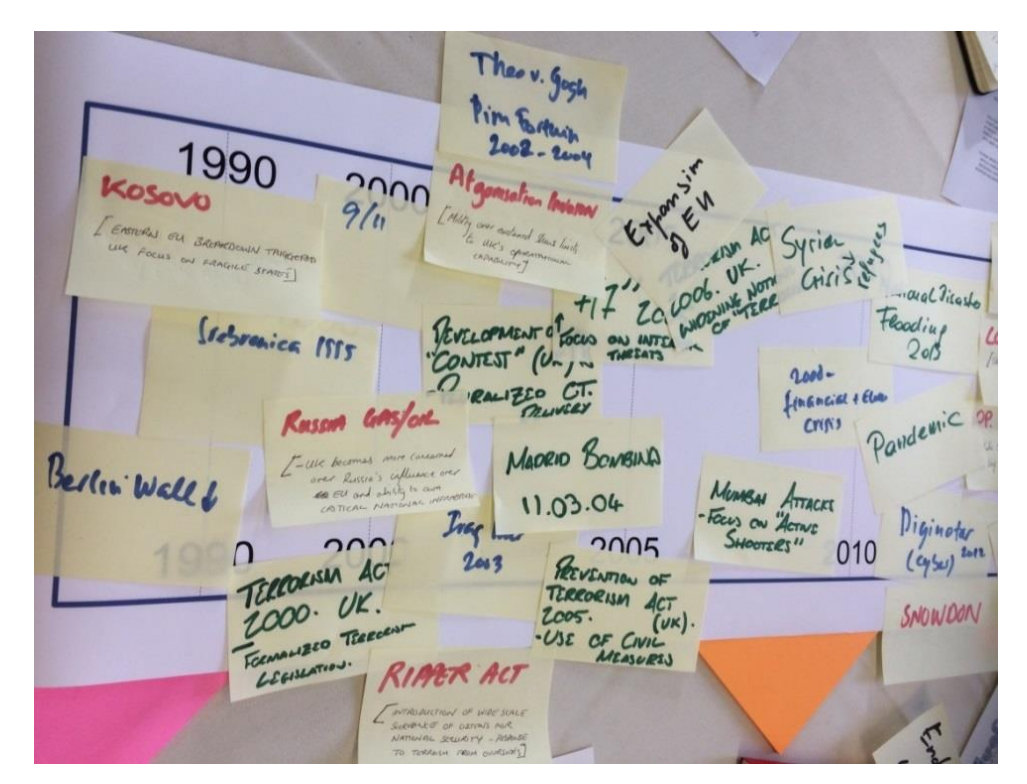
Figure 2a: An example of a timeline created by one of the participants' group

The aim of Discussion One - Timeline exercise - was to find out the main influencers of security (e.g. events, actions, policies). The participants on each table were encouraged to write down the main influences and arrange these on the timeline that was provided for each table (Figure 2a). All of the inputs into the five table based timeline exercises were then consolidated into a large timeline that was posted onto the wall of the workshop room (Figure 2b).