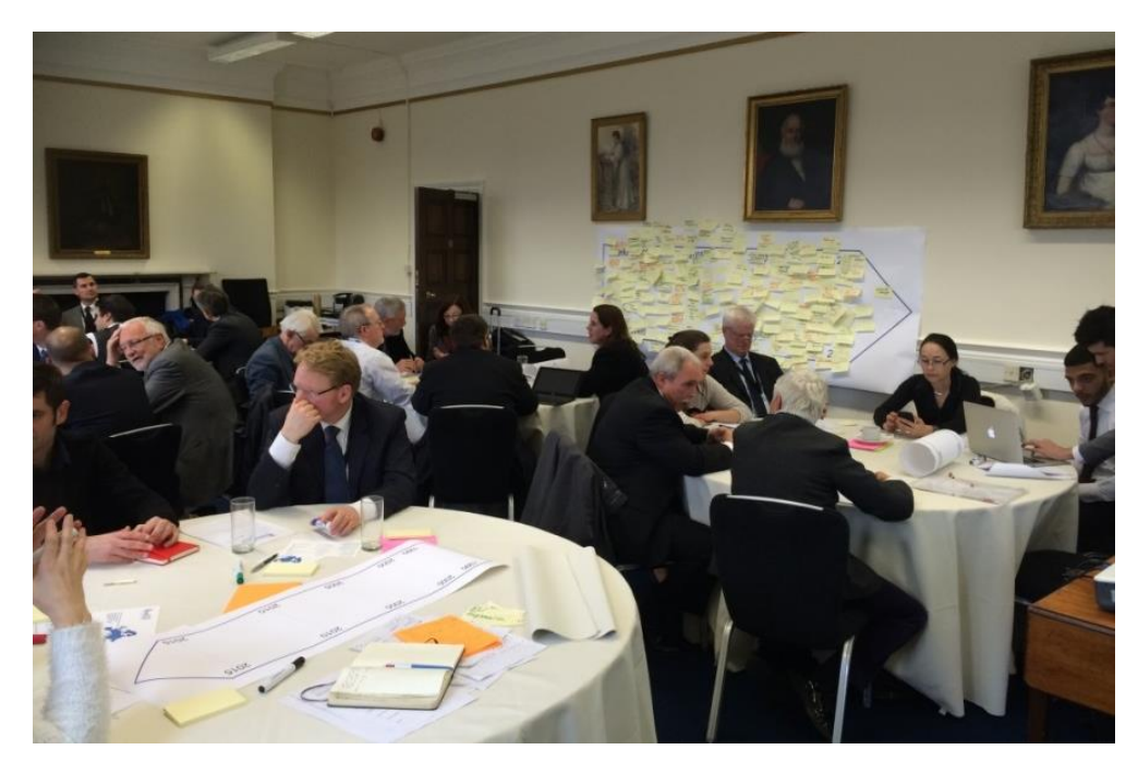
Figure 1: WP7 North-West case study workshop

The aim of Discussion One - Timeline exercise - was to find out the main influencers of security (e.g. events, actions, policies). The participants on each table were encouraged to write down the main influences and arrange these on the timeline that was provided for each table (Figure 2a). All of the inputs into the five table based timeline exercises were then consolidated into a large timeline that was posted onto the wall of the workshop room (Figure 2b).