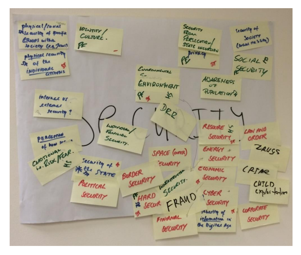
Figure 3: An example of the security dimensions mapped out by one of the participants' group

Discussion Three comprised of the presentation of the preliminary North-West Europe region coding results (Appendix B) and a question and answer session; the participants were encouraged to comment on the presented snapshots of the coding results and also provide suggestions about what the future of security might look like (over the next 5 years).