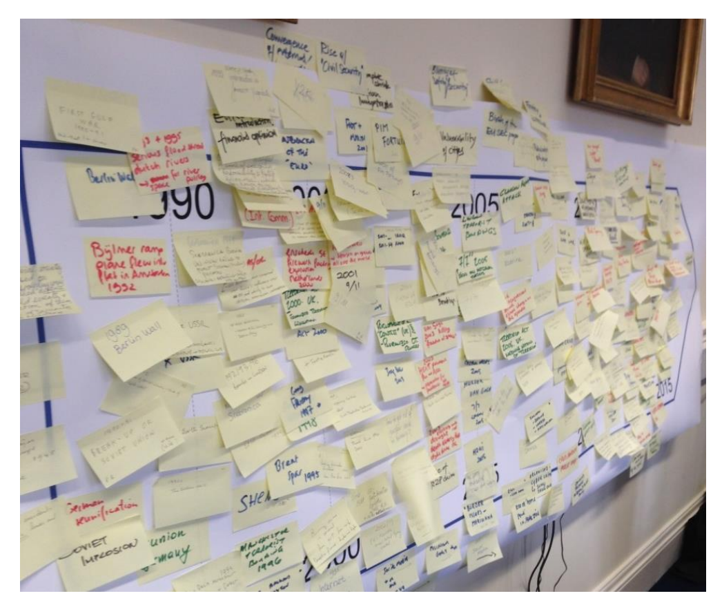
Figure 2b: Overview of the large consolidated timeline

The aim of Discussion Two - What is Security for you? - was to answer the following questions: